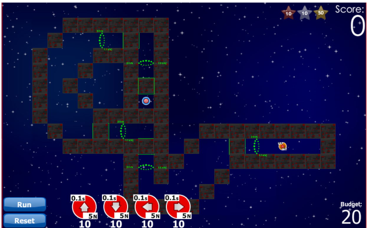
Figure 2. More elaborate SURGE Next “Boss” mission