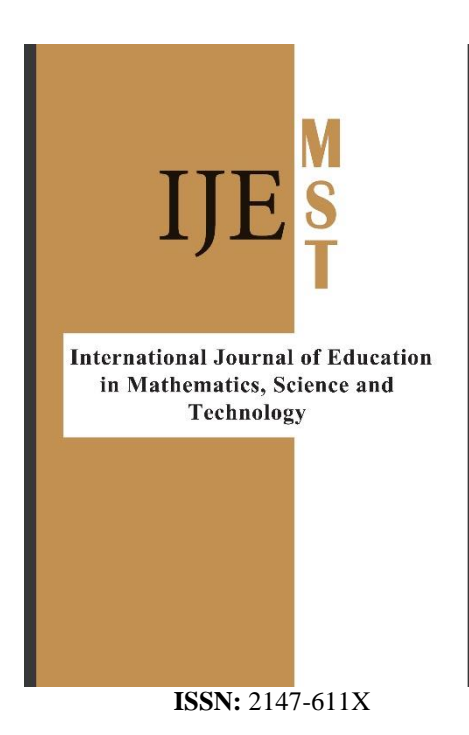
International Journal of Education in Mathematics, Science and Technology (IJEMST)