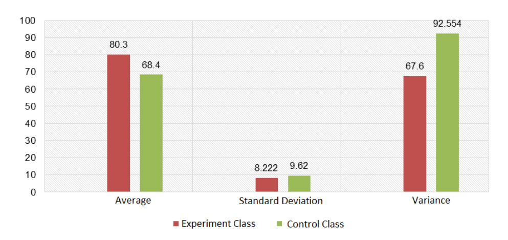
Figure 2. Experiment Class Post-test Data and Control Class

Table 2 shows a comparison of the results of the experiment class post-test and the control class, with the average post-test value of the experiment class being 80.3 and the standard deviation being 8,222. While the average post-test result of the control class is 68.4, and the standard deviation is 9.620. Based on these data, it can be described through the histogram in Figure 2.