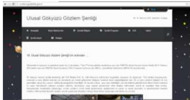
Figure 2. Sharing related to the national sky observation event

The students had the opportunity to share the subject/concepts of the astronomy course or links, images, and information related to the subject/concepts outside of the learning environment. A shared image is shown in Figure 2.